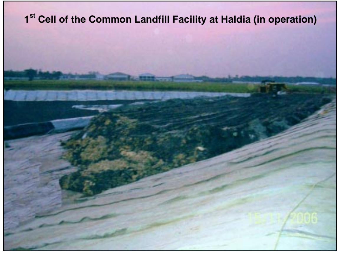
First Cell of the Common Landfilll facility at Haldia (in operation)