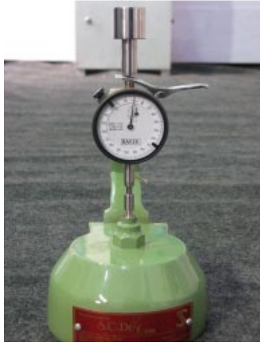
Gauge Meter is used for measuring the thickness of plastic carry bags

Plastic waste is a significant contributor to nonbiodegradable disposables. Of the total quantum of one lakh tones of waste generated everyday in India, about 4 per cent comprise of plastic waste. Due to its non-biodegradable nature, waste plastic poses threat to human health and causes irreparable damage to the environment. Discarded plastic also hinders the natural aeration process of surface water bodies, choke municipal sewer lines, block storm water drains and also clogs the bar-screens of sewage treatment plants. They interfere with various agricultural operations and prevent natural recharge of groundwater. Consumption of food wrapped in coloured plastics also has adverse health effects. Death of domestic animals has been reported from ingestion of littered plastic carry bags. Further, it causes landslide in the hills.