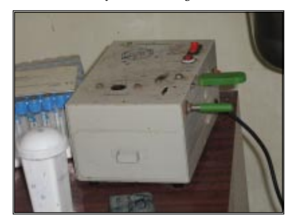
Electrical needle destroyer used for mutilation/destruction of used disposable syringes