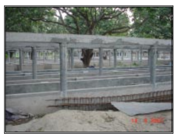
Construction of Vermi compost pits for the Model Facility Project in North Dum Dum and New Barrackpore municipal areas

The Memorandum of Understanding (MoU) between the CPCB, WBPCB, KMDA and the Chairpersons of North Dumdum Municipality and New Barrackpore Municipality had been signed. The total project cost for the second phase is Rs.374 lakhs. The construction of 75 vermicompost pits, boundary wall, approach road, etc. are in progress. The size of the each pit will be 15 m x 1.5 m. The capacity of the compost plant will be 50 MT/day.