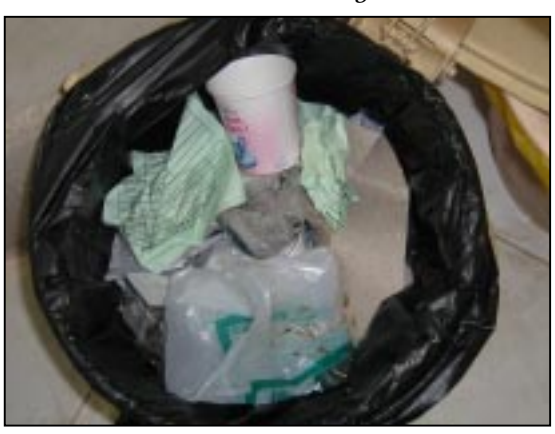
General wastes of health care unit kept in black coloured bag