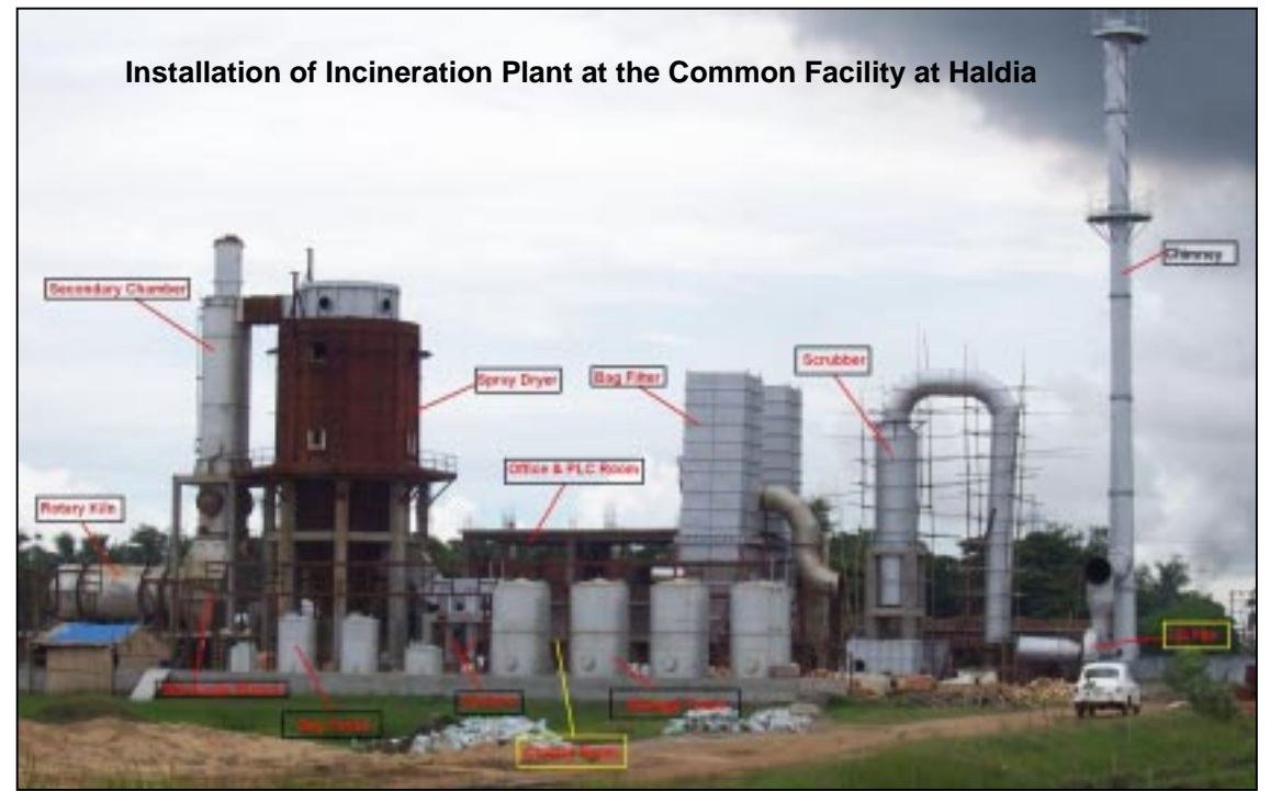
INstallaation of incineartion plant at the common facility at Haldia