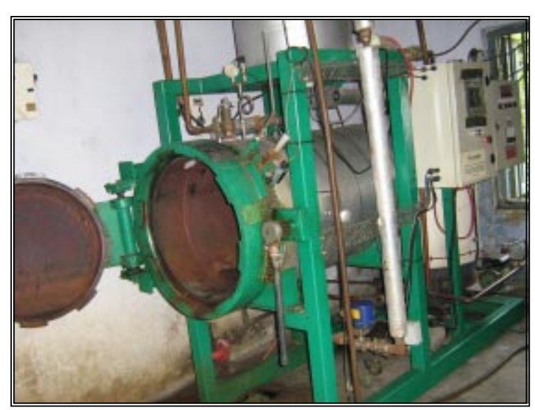
Autoclave installed at JNM Hospital-Kalyani under WBHSDP, Health Department, Government of West Bengal for treatment of non-anatomical bio-medical waste